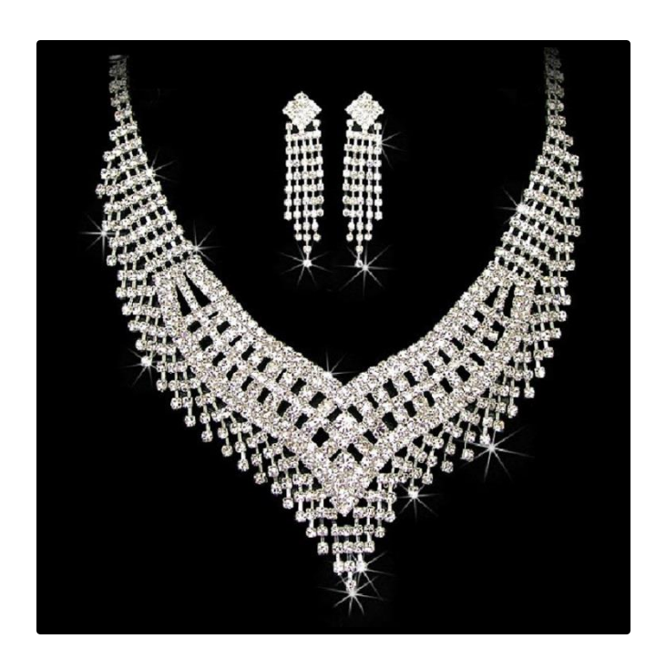
(Photograph of Jewelry Set)