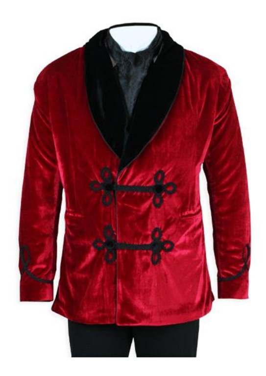
(Vintage Smoking Jacket)