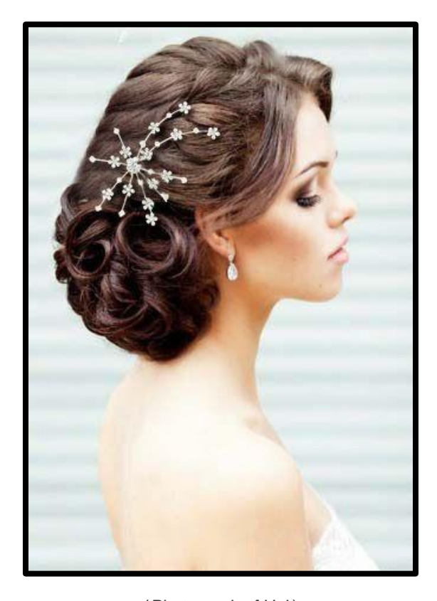
(Photograph of Hair)

scene so that she can tear it down as she realizes she has been viewed as a doll. She may look better off under Higgins's teachings, but because of how society functions towards women and towards Hispanics, he takes more from her than she's willing to lose, and her exterior finally begins to reflect her emotions instead of the desires of society.